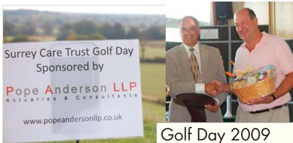
Golf Day 2009