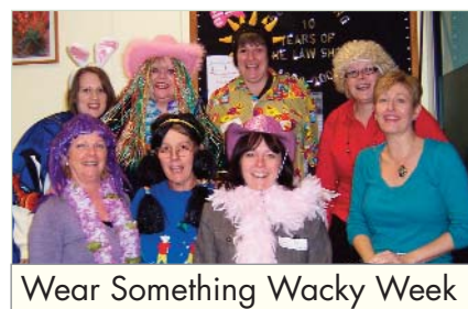
Wear Something Wacky Week