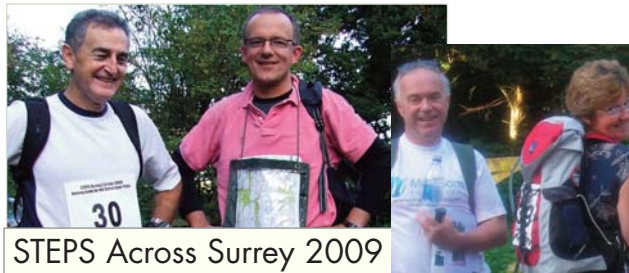
STEPS Across Surrey 2009