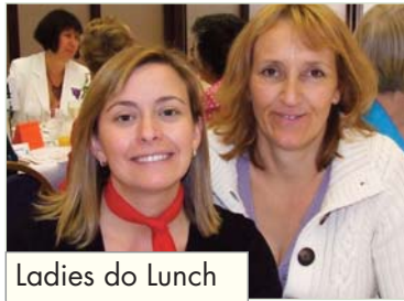
Ladies do Lunch

We held our second Wear Something Wacky Week in 2010 and are asking businesses to hold wacky dress down days throughout the year, a Wear a Wacky Tie, a Dotty Day or a Wear Your Wellies to Work Day!