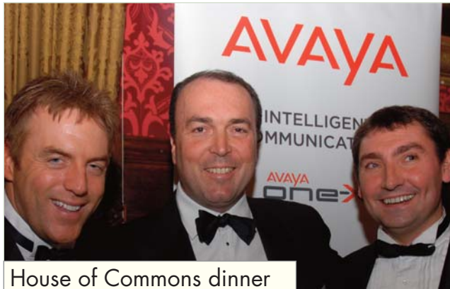
House of Commons dinner