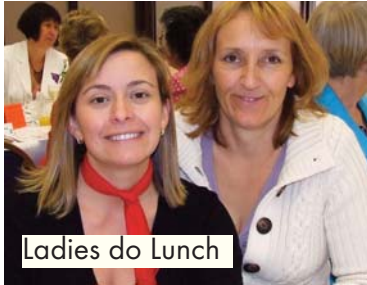
Ladies do Lunch

Sponsorship of our fundraising events contributes enormously to their success. Events in recent years have included dinners at the House of Commons and House of Lords, the STEPS Across Surrey marathon sponsored walks, our Simply Silver Ball at Wentworth our Golf Days at Merrist Wood, Hindhead and West Surrey and our Ladies Do Lunches.