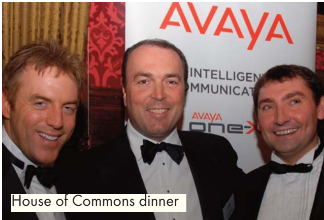
House of Commons dinner