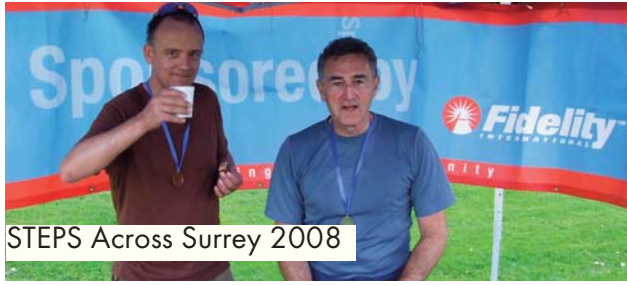
STEPS Across Surrey 2008